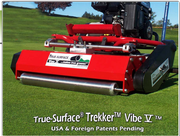
True-Surface® Trekker™ Vibe ∇™ USA & Foreign Patents Pending

More than just a rolling unit, the True-Surface® Trekker™ Vibe ∇™ is the least disruptive method to shake-in sand topdressing, remove morning dew, smooth your greens after core aeration, and help eliminate sand bridging in aeration holes.